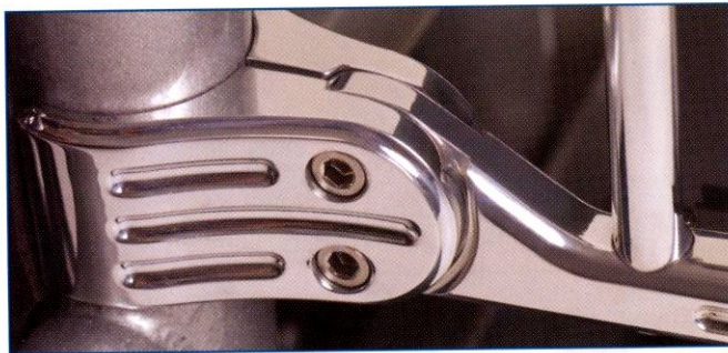
Cage Mount Bracket