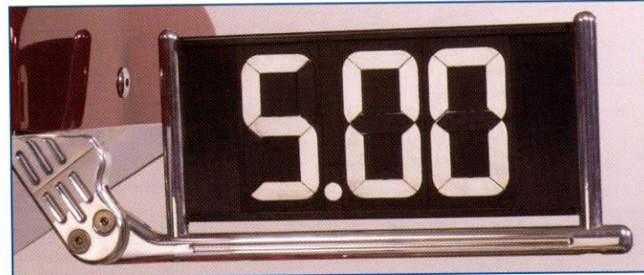
Universal Adjustable Angle Mount Bracket